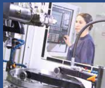
NKE Steyr, Austria